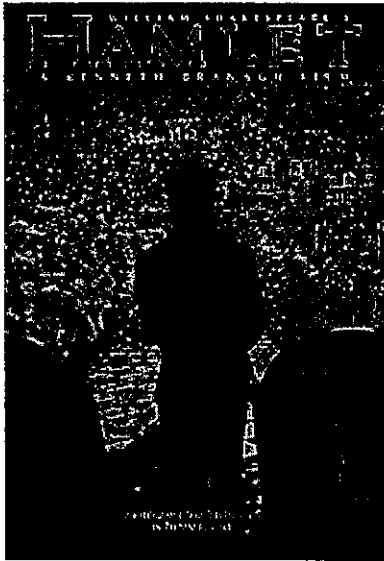
Doing it right: Kenneth Branagh's film adaptation of Hamlet shows his passion for Shakespeare

I believe there is a future where theatre and film can coexist, but we have deviated from that course. If we are to truly embrace our humanity we must not only look forward, but back, to our lengthy and complex relationship with stage performances. I think the answer to the dilemma of dwindling audience numbers lies somewhere in between embracing the art form and understanding that we live in a changed world. Film often changes too much, but adaptations that remain on the stage can be wonderful celebrations of a merge between the new and the old. The theatre community must answer to this call from the generation of today for something new and exciting. Let us not shy away, but instead endeavour to bring the world of theatre to a whole new audience.